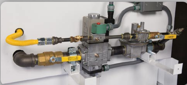
MOTORIZED GAS CONTROL TO REDUCE POSSIBLE RAPID TEMPERATURE FLUCTUATIONS