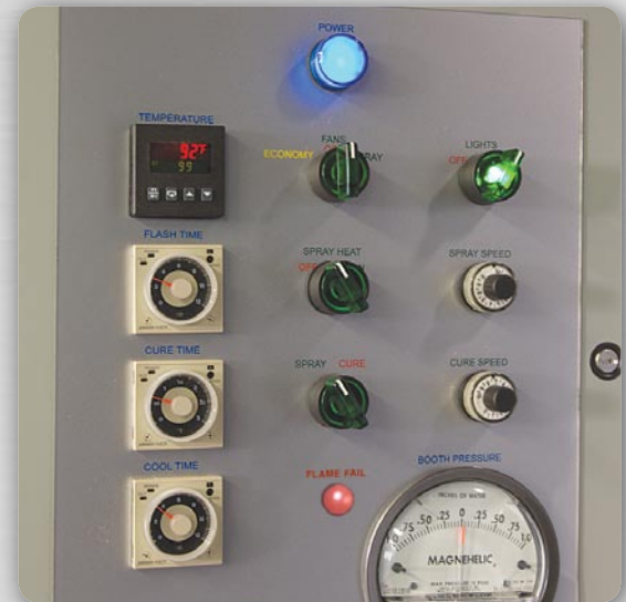
UL LISTED CONTROL PANEL WITH VFD ENERGY SAVER "PREP" MODE