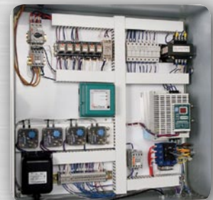
DIGITAL MICROPROCESSOR, PID, DUAL SET POINT TEMP CONTROL