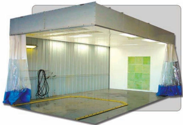
SHOWN WITH OPTIONAL POWDER COATING WHITE AND GOFF'S™ CURTAINS.